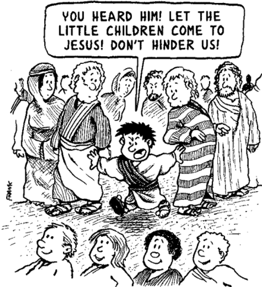
ZACCHAEUS'S FIRST ATTEMPT TO SEE JESUS.